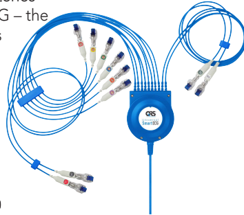
Product Code Z-7000-0500

Draws its power from the PC: No batteries are required with the Universal SmartECG – the power is drawn from the PC or tablet it is connected to by the USB port.